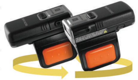
AMBIDEXTROUS RING TRIGGER

For the further inquiry, please contact: service@pointmobile.com