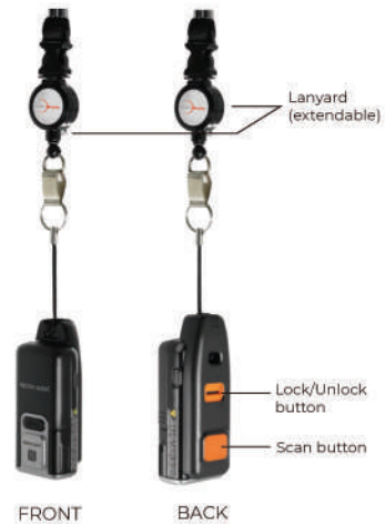
USB-C SLED (WITH LANYARD)