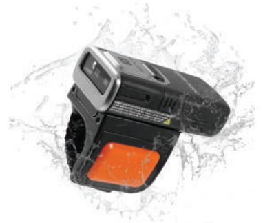
IP65 WATER/DUST RESISTANCE